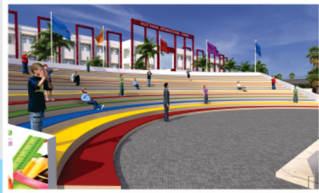
Stage for Theater & Dramatics