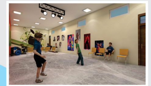
Dance & Music Classroom