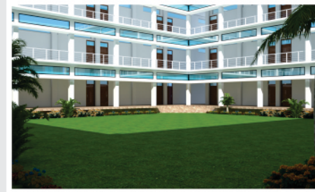
Clean & Hygienic Class Rooms and corridors.