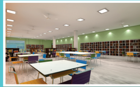
Well Resourced Library