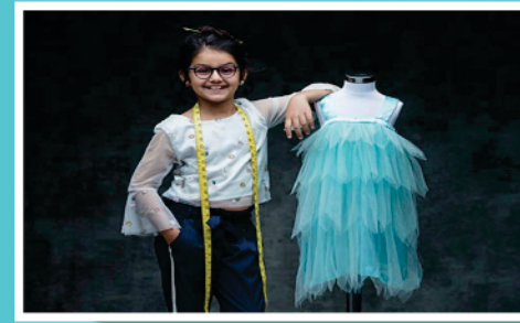
I Want to Make My Dream Career

“ Success Is About Balancing Your Learning & Leading Life Purposefully ”